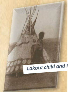
Lakota child and tipi

Lakota women had a lot of responsibilities. She skinned the animals, cooked, harvested, gathered firewood, preserved the meat, used buffalo parts for tools and skins, made clothes and quilts, cared for the home, tanned the hides for the shelter, set up and took down the tipi after each move, and instructed the children. The only thing the women did not do was go to war and hunt. To some, this may seem excessive, but these women put a lot of value on their purpose in life and were very proud of the work they did. The Lakota daughters were given special attention and stayed with their mothers and grandmothers until they wed. They learned how to be a wife and mother from the elder women. A young woman was not even suitable for marriage until she learned how to do what was expected of her.