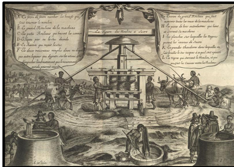
Sugar mills with vertical rollers, French West Indies, 1665.

Before Jamaica today, the Benjamite were enslaved by the British and Spainards in which they gained “independence” from 1962. Millions of Israelites which fled and inhabited the land of Africa (Ham) and were shipped over to the Carribbean by the Arabs and Africans to become slaves. Christopher Columbus discovered the land of Jamaica and destroyed the Taino and Arawak people that dwelt in the land. One of the heaviest slave plantations in Jamaica was the sugar plantation (sugar cane) and a haven for pirates who harassed Spanish shipping. Benjamin was such a fierce tribe that during slavery they rebelled and revolted in the 1720 and 1790s where the Maroons went to war. As prophesied in Genesis 49:27