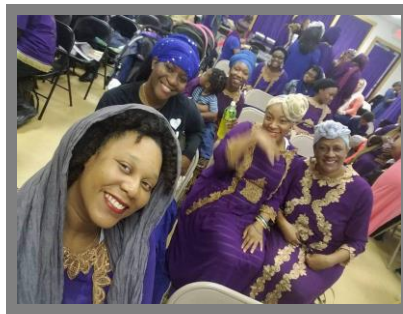
(Sabbath fun with Mama and sisters)

"Staying committed and enduring in the truth all while rehearsing the righteous acts with my lord. Being able to lord willing walk through one of the 12 gates."