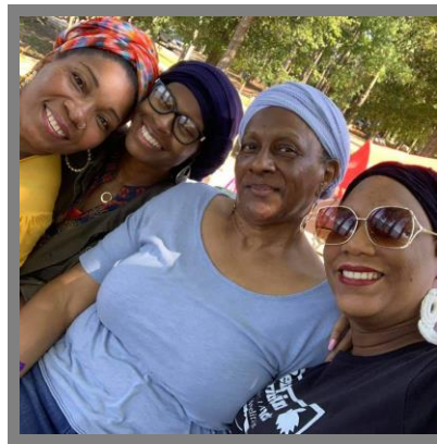
(Feast of Tabernacles 2020)

With her, I can get those much-needed Mama hugs, tips on raising my young children, subtle nods of approval, and looks that say "get it together" when needed.