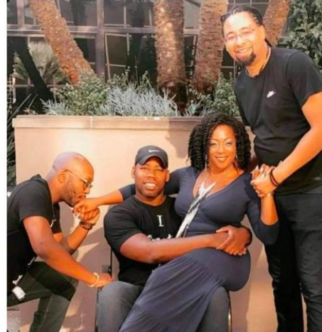
Caption 4: A woman with several men.