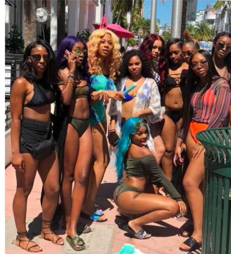
Caption 8: Women wearing bikinis at the beach.