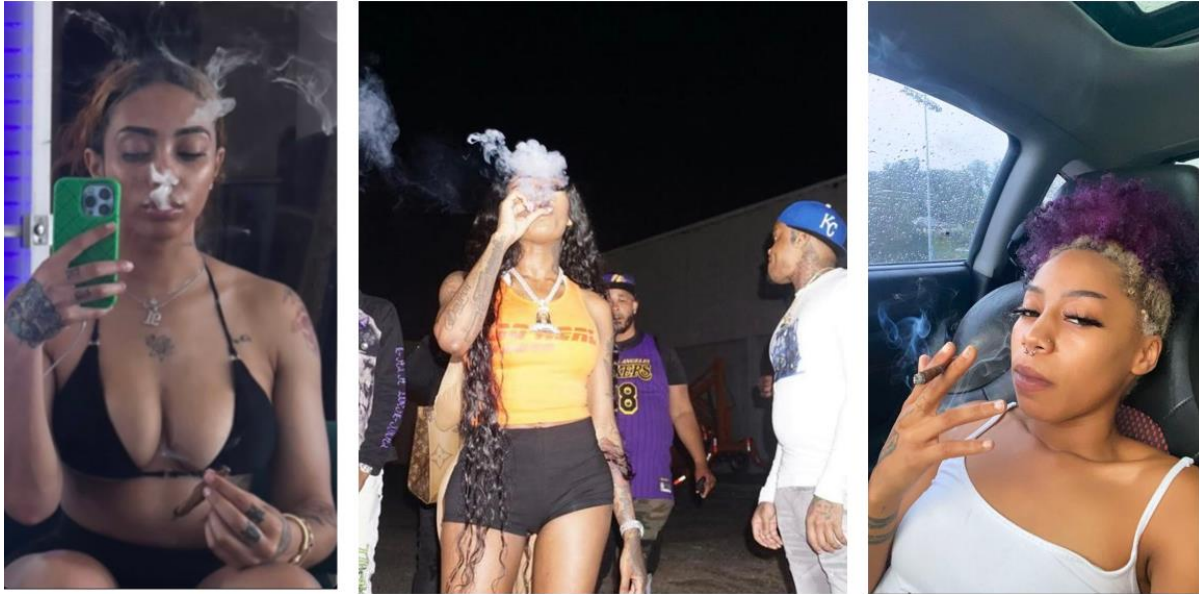
Caption 6: Shameless daughters smoking and hanging out with men.