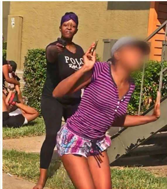
Caption 9: Women fighting.