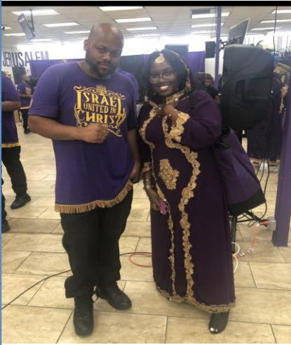
Proving: First Date 2months in