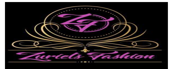
Zuriel Israel (2021) Zuriel's Fashion, Retrieved from https://zurielfashion.com/

Remember princesses, we are trend-setters for teenage girls in the world, so let your light shine brightly. (Matthew 5:16)