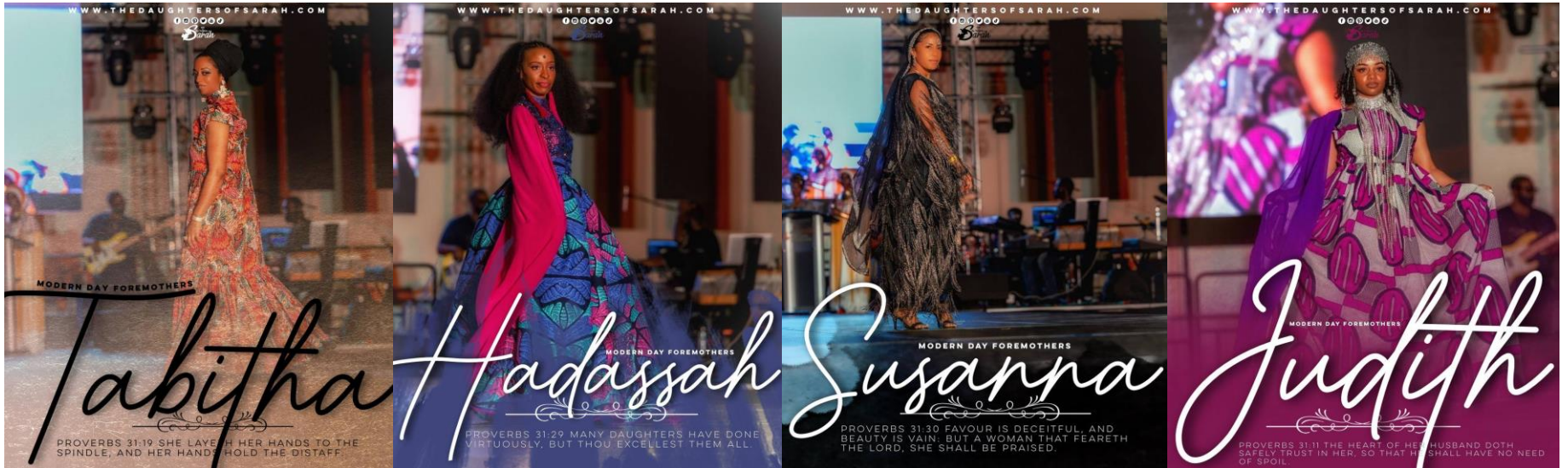
(2021 Passover Fashion Show)