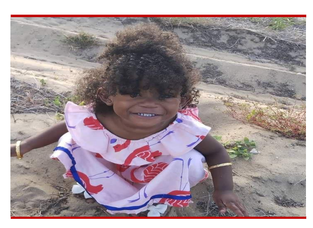
"Train up a child in the way he should go: and when he is old, he will not depart from it." Proverbs 22:6

The key to addressing our "mommy issues" that plague our communities is keeping the commandments, communication, and holding ourselves accountable for how we parent.