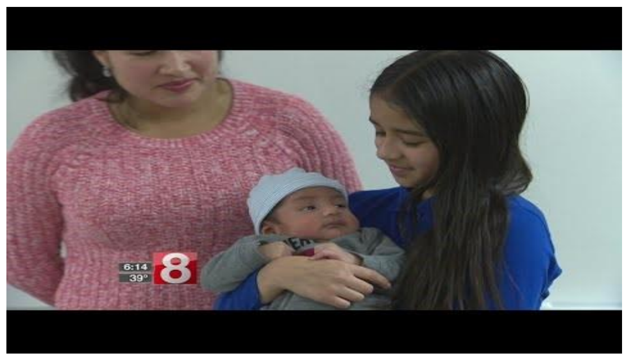
How to help during ...