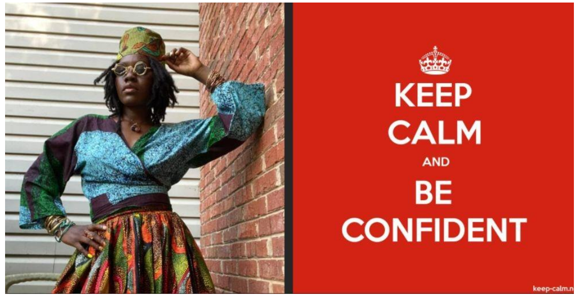
[video] Modestly Dressed Video - IUIC Nor Cal

☐ There is judgement for not following God's dress code.